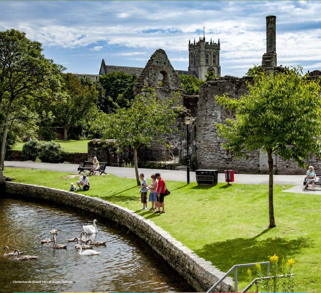
Christchurch (Event 15)

East Dorset Heritage Trust a llendale house